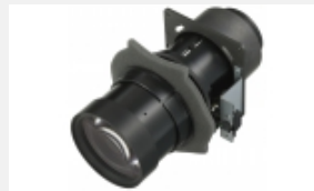
VPLL-Z1024 Projection Lens for the VPL-F Series