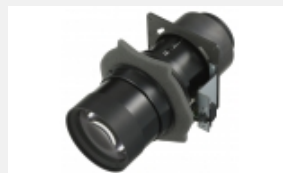
VPLL-Z1032 Projection Lens for the VPL-F Series