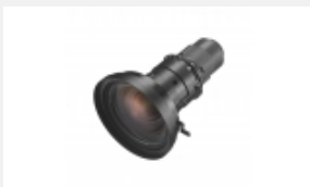
VPLL-2007 Projection Lens for the VPL-F Series