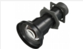
VPLL-1008 Projection Lens for the VPL-F Series