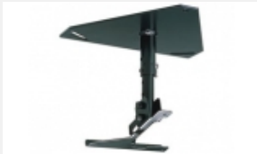
PSS-610 Projector Ceiling Bracket for the VPL-F Series