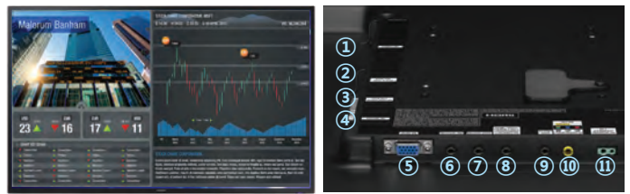
①HDBT IN ②USB ③DVI IN/MAGICINFO IN ④HDMI IN ⑤RGB IN ⑥RSC232 IN ⑦RSC232C OUT ⑧AUDIO IN ⑨AUDIO OUT ⑩COMPONENT IN ⑪IR/AMBIENT SENSOR IN