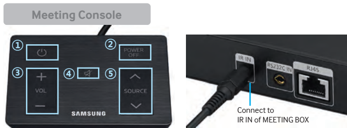
①POWER ON ②POWER OFF ③VOLUME +/- ④MUTE ⑤SOURCE CHANGE