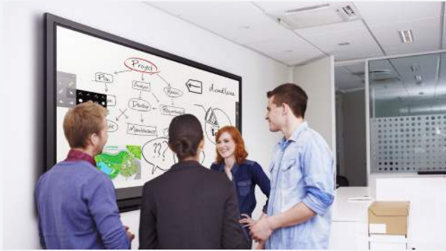
Figure 1. Increase productivity with interactive meetings