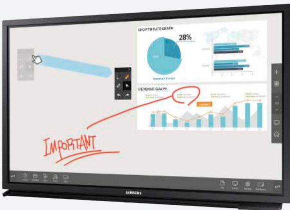
Figure 4. Feature for Easy Floating Menu and Draw on any Source