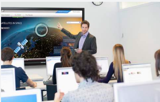
Figure 2. New lines of communication in the classroom

Gone are the days of educators needing to factor in the logistics of a typical projector system and the pitfalls and distractions that they come with. Samsung Interactive Whiteboard Solution converts these past shortcomings into strengths through effective utilization of FHD displays and interactive whiteboards. New lines of communication between teachers and students can now be forged, through data and file-sharing capabilities between the Interactive Whiteboard Solution and devices of students, thus further creating an interactive presentation environment that holds attention spans and creates opportunity to diversify learning approaches. Samsung Interactive Whiteboard Solution is well suited to help you convert your classroom into an intensive and engaging learning environment.