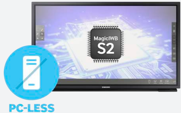
Figure 3. Embedded e-Board Solution that doesn't require a dedicated PC